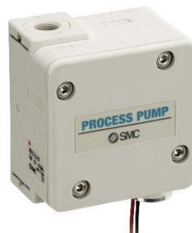
Model No. PB1011A-*01-*