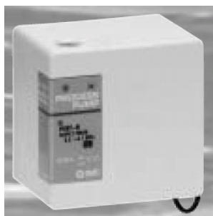
Model No. PB1011-*01-*